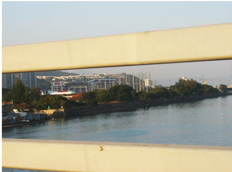
VSR7 - View from Dragon Bridge