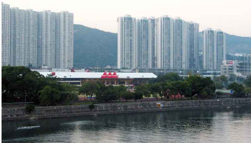
VSR8 - View from floating restaurant