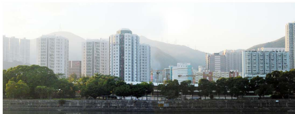
VSR9 - View from cycle track next to Ravana Garden